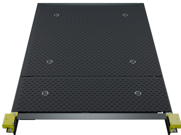
*with release plate

WIDE SIDE SLIP TESTER WITH RELEASE PLATE