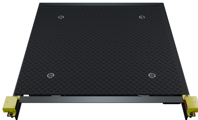
*without release plate

The slip value obtained is used to measure the trajectory deviation of a vehicle axle. This measurement is expressed in m/km or mm/m.